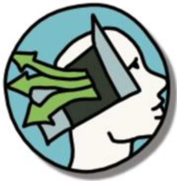
Making Thinking Visible